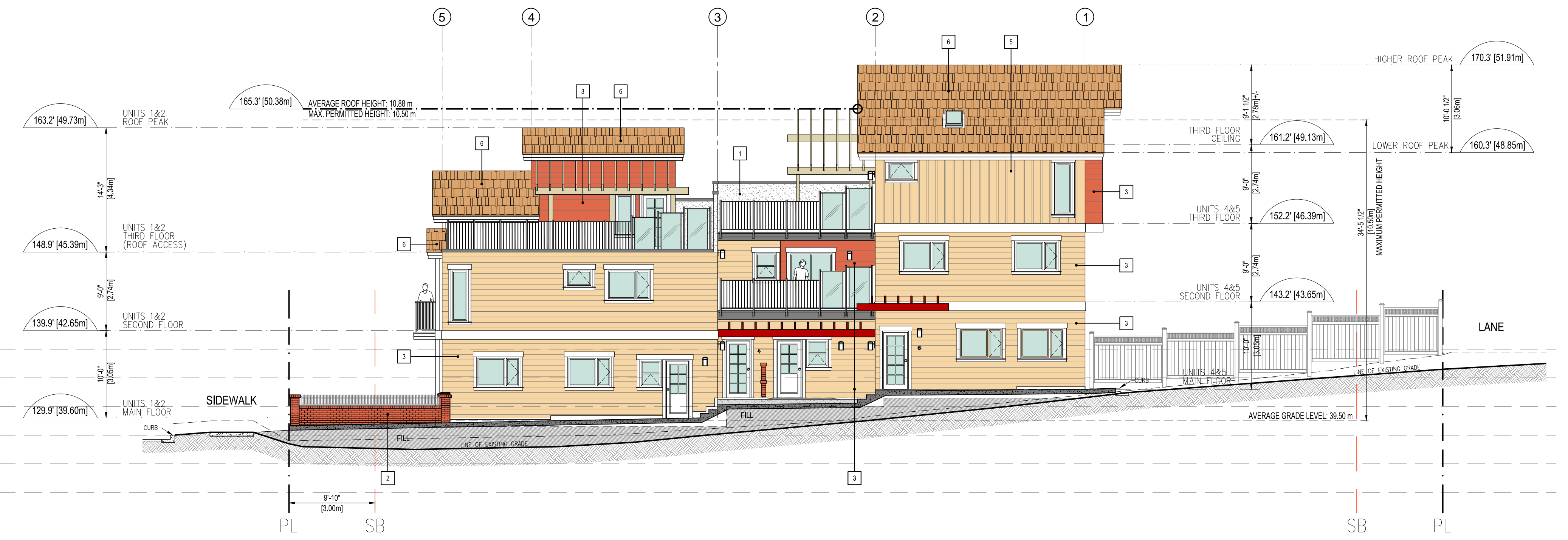
NORTH ELEVATION SCALE: 1/8"=1'-0"